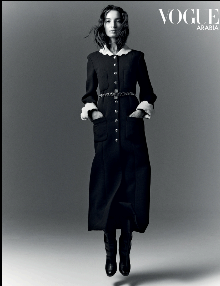
VOGUE ARABIA - CHANEL